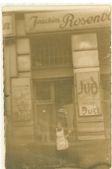
Vienna shop front defaced: "Jude" (Jew)

Hitler's power grew through the 1930s, undergoing a radicalisation in 1938 that encouraged him to move against Austria on 15th March of that year. This "Anschluss" (annexation) continued a period of especially severe hatred against the Jews and the anti-Jewish laws in Germany were enforced in Austria too. On 9th November 1938, a night now commemorated as Kristallnacht (Night of the Broken Glass) SA and SS men pretending to be citizens, set fire to 1000 synagogues, smashed up 7,500 Jewish businesses, fatally assaulted 90 Jewish men and herded 30,000 Jews into concentration camps, pending ransom.