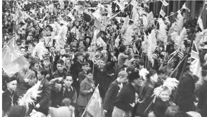
VE-Day Celebrations in Christchurch