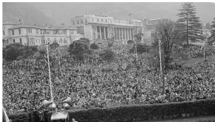
VE-Day Celebration outside Parliament, Wellington