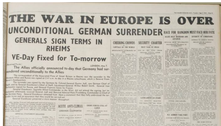
VE-Day headline, Nelson Mail